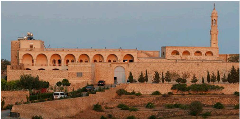
Mor Gabriel Monastery, Mardin

Legislative changes should be made in order to ensure the return of the immovable property which has been seized through expropriation or any other way, from all belief groups.